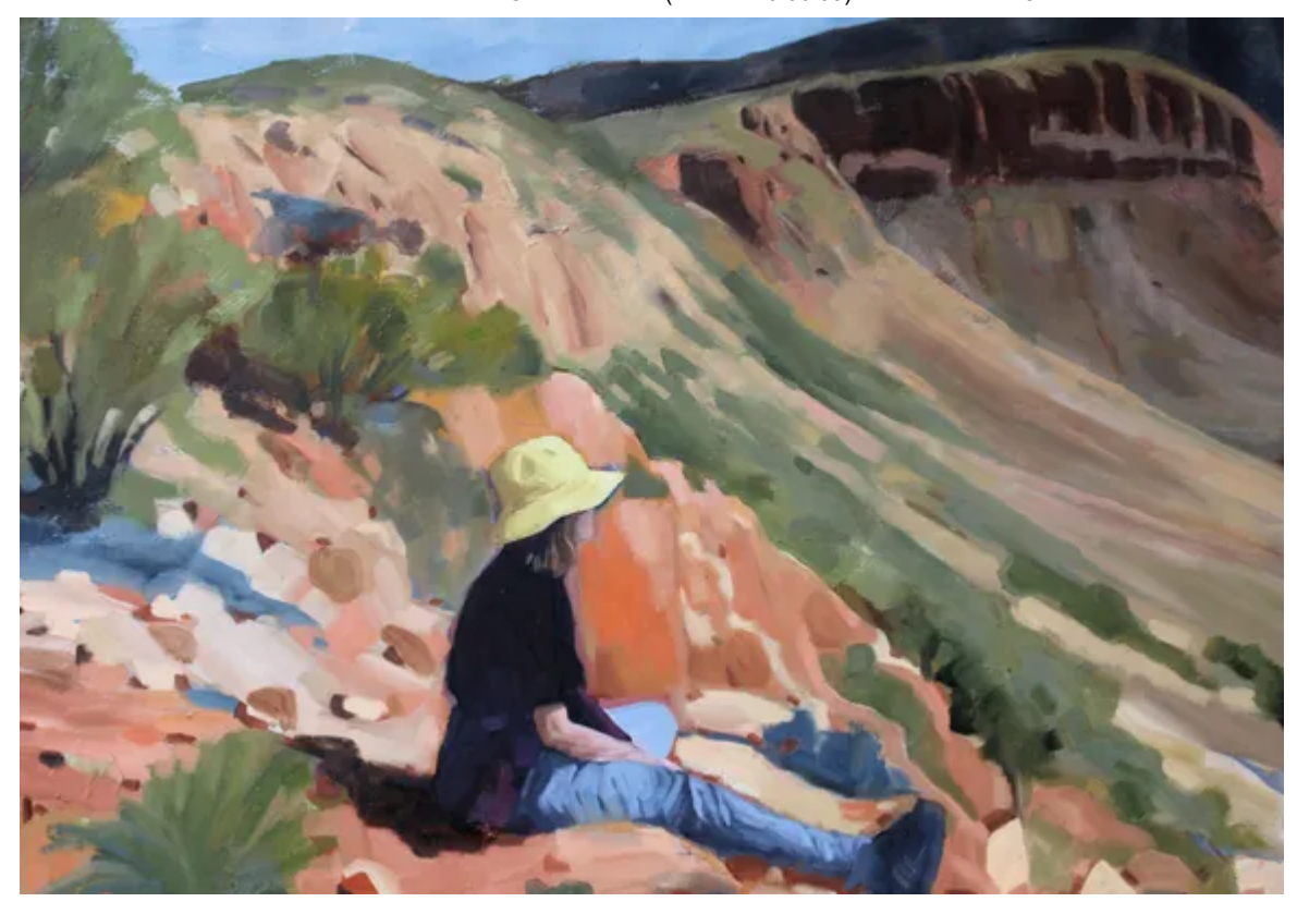
Roomy and Full