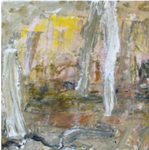
Hint of Spring Acrylic on stretched canvas 30 x 30cm Framed in Tasmanian Oak $480