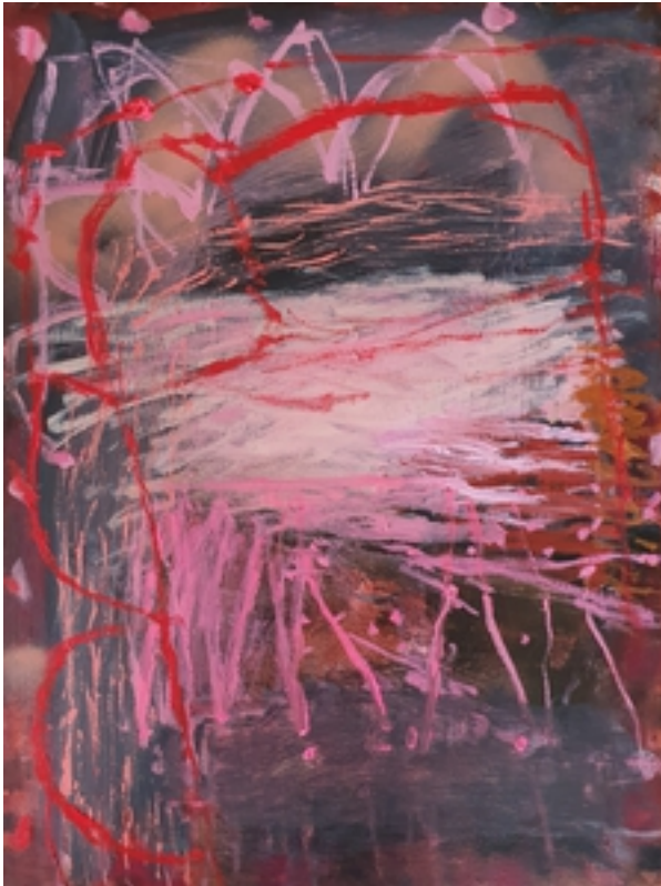
Rocky River Crossing, 2021 48 x 64 cm Acrylic and aerosol on canvas, Framed. $1050