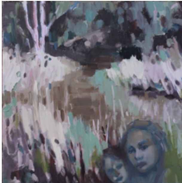
Love Looks Like 30 x 30cm Oil on linen $460