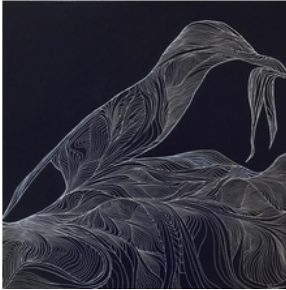
Gone Fishing Acrylic on gallery wrapped canvas 41 x 41 cm $410