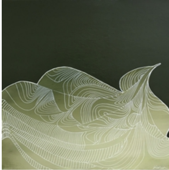
Phosphorescence Acrylic on gallery wrapped canvas 30.5 x 30.5 cm $310