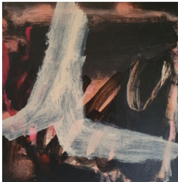
Fern Tree Creek, 2021 30 x 30 cm Acrylic and aerosol on canvas $410