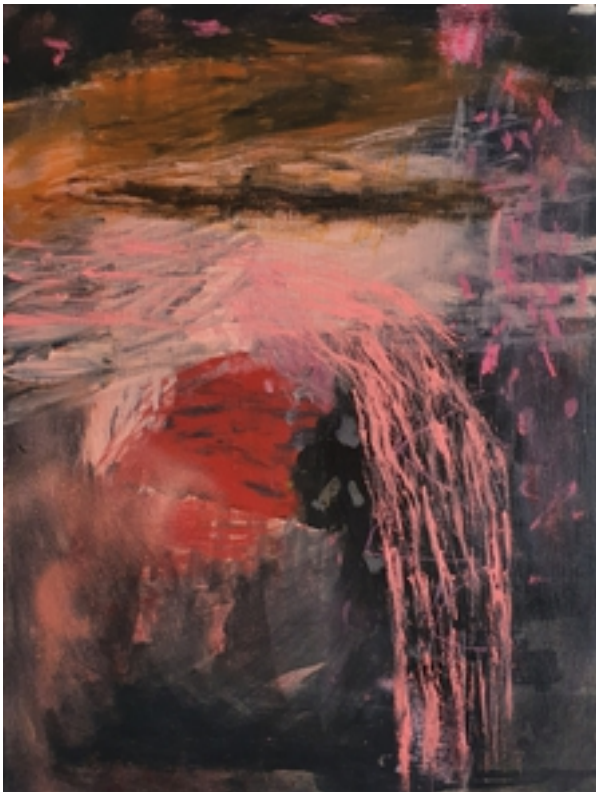
Woodlands of Ancient Rainforest, 2021 48 x 64 cm Acrylic and aerosol on canvas, Framed. $1050