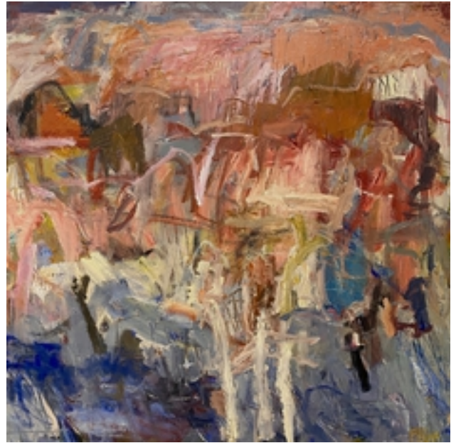
Birds Eye View - Diptych Acrylic and mixed media on stretched canvas Framed separately in Tasmanian Oak 94 x 94 cm each $3400