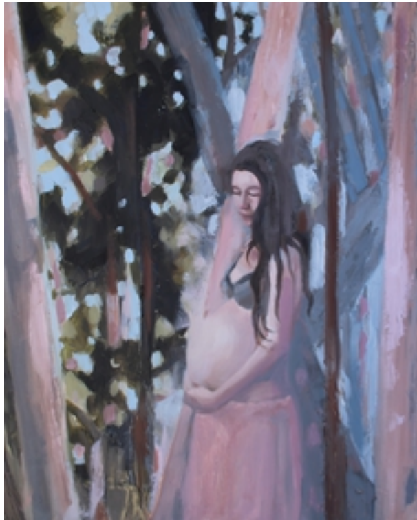
Here Now 40 x 50 cm Oil on linen $680