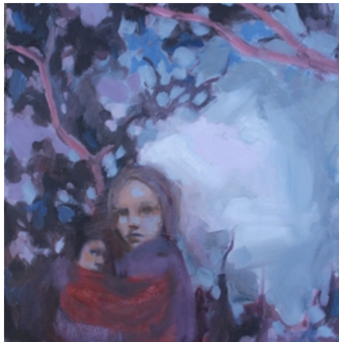
Child of Mine 40 x 40 cm Oil on wood $480