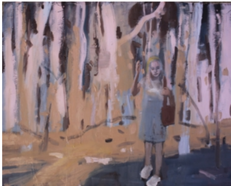
New Ground 50 x 40 cm Oil on wood $680