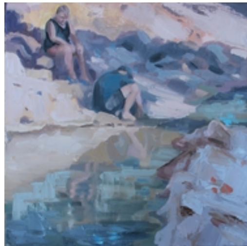
Fossicking 30 x 30 cm Oil on canvas $420