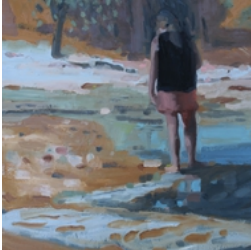
Seeking 30 x 30 cm Oil on canvas $420