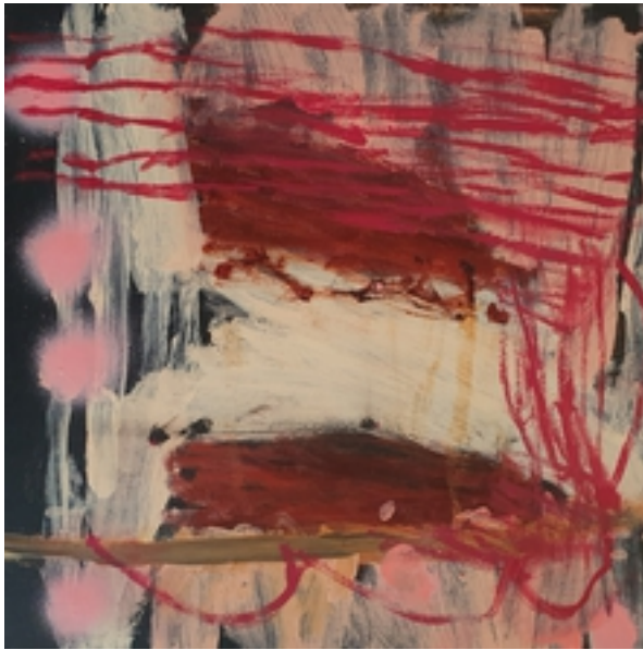
White Rock over River Gorge, 2021 30 x 30 cm Acrylic and aerosol on canvas $410