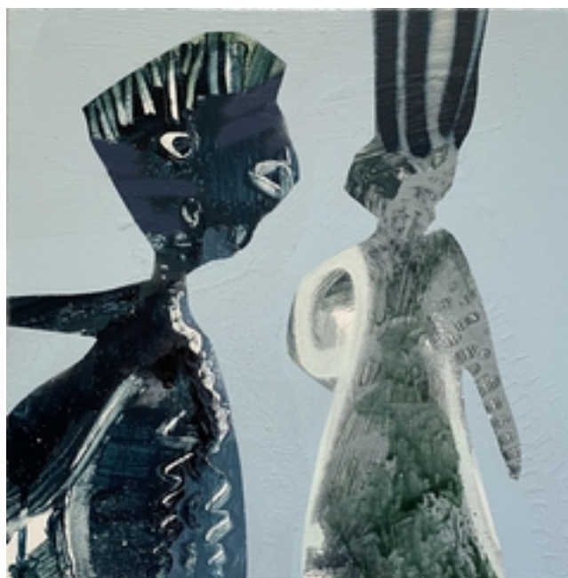
Me and You Acrylic & spray paint on canvas 30 x 30 x 3.8 cm $550