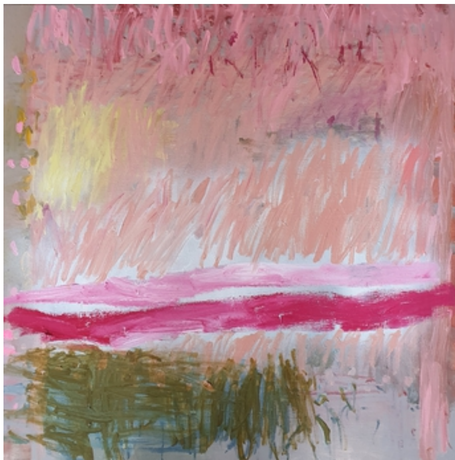
River Walk and Swimming Reflections, 2021 76 x 76 cm Acrylic and aerosol on canvas $1,620