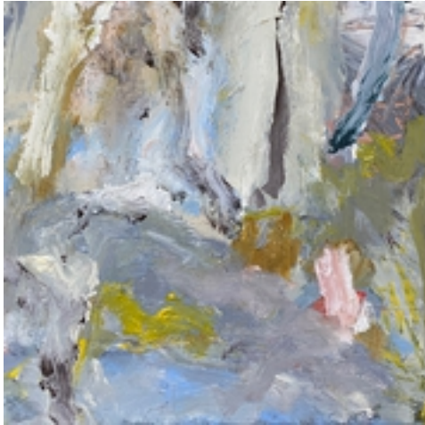
Snowy Sunny Acrylic on stretched canvas 30 x 30cm Framed in Tasmanian Oak $480