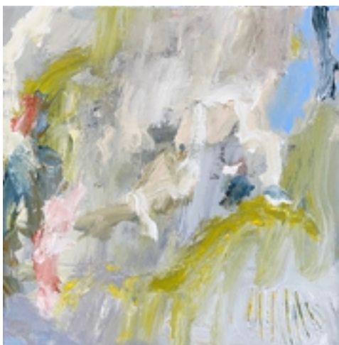
Bush Sketch Acrylic on stretched canvas 30 x 30cm Framed in Tasmanian Oak $480