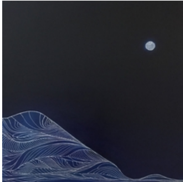
Nightscape Acrylic on gallery wrapped canvas 41cm x 41cm $410