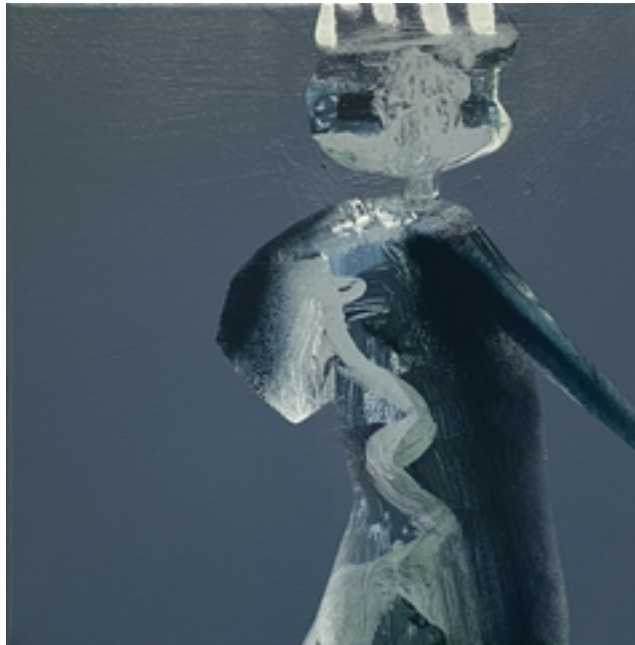
Holiday Walking Acrylic & spray paint on canvas 30 x 30 x 3.8 cm $550