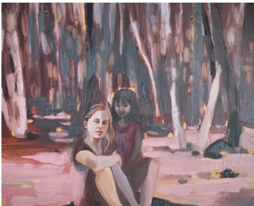
She Said 50 x 40 cm Oil on linen $680