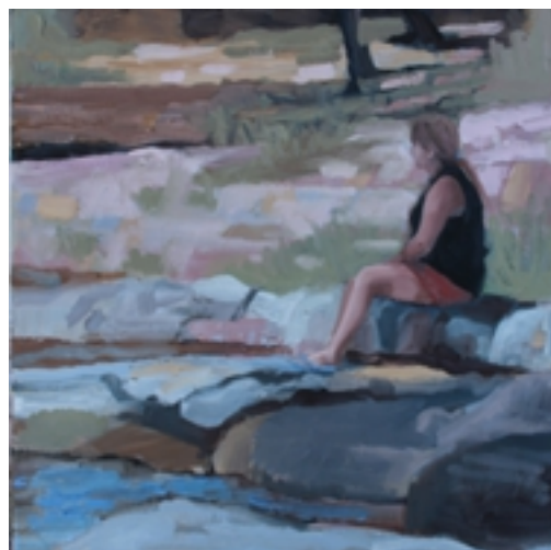
Searching 30 x 30 cm Oil on canvas $420