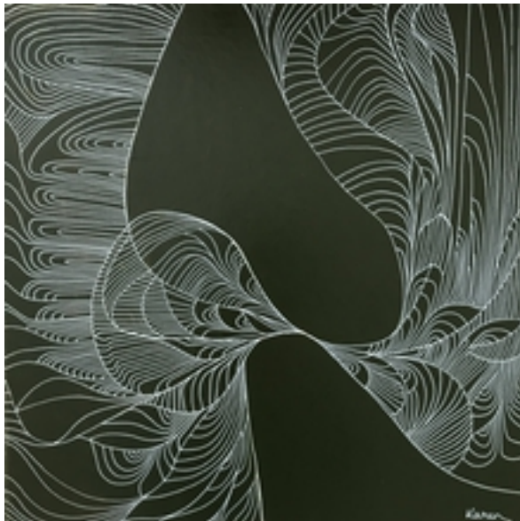
Reflection Acrylic on gallery wrapped canvas 30.5 x 30.5 cm $310