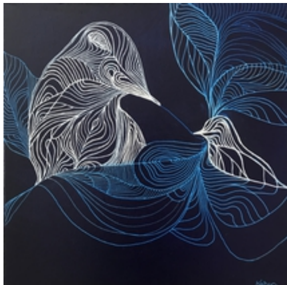
Nurture Acrylic on gallery wrapped canvas 30.5 x 30.5 cm $310