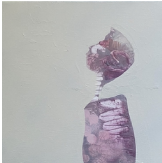
A Sunset of Ideas Acrylic & spray paint on canvas 30 x 30 x 3.8 cm $550