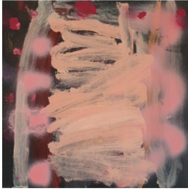
Girriwa Track , 2021 30 x 30 cm Acrylic and aerosol on canvas $410