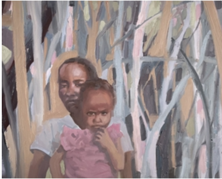
End Game 50 x 40 cm Oil on linen $680