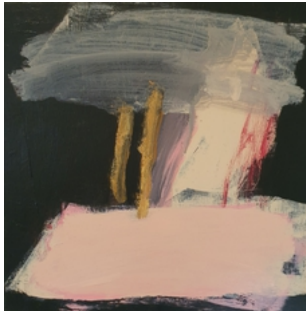
Buraga Swamp , 2021 30 x 30 cm Acrylic and aerosol on canvas $410